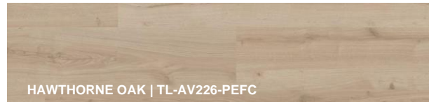
HAWTHORNE OAK | TL-AV226-PEFC