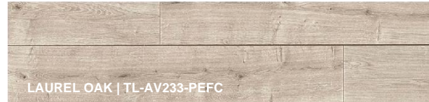
LAUREL OAK | TL-AV233-PEFC