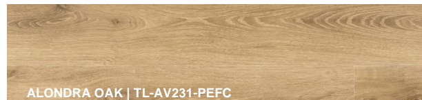
ALONDRA OAK | TL-AV231-PEFC