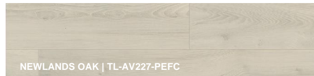
NEWLANDS OAK | TL-AV227-PEFC