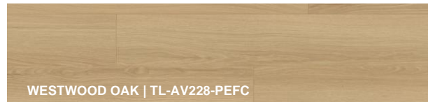
WESTWOOD OAK | TL-AV228-PEFC