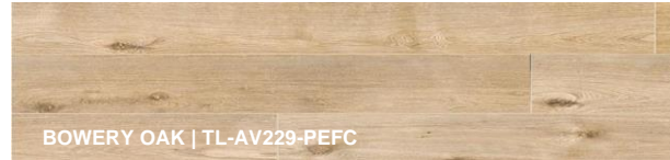
BOWERY OAK | TL-AV229-PEFC