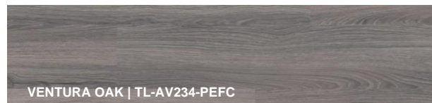
VENTURA OAK | TL-AV234-PEFC