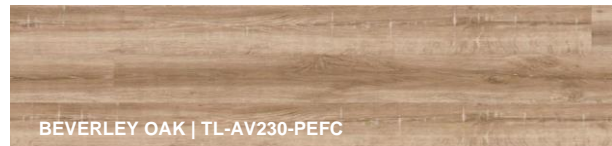
BEVERLEY OAK | TL-AV230-PEFC