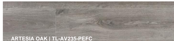
ARTESIA OAK | TL-AV235-PEFC