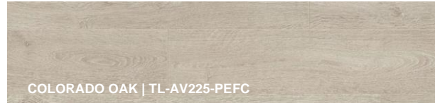
COLORADO OAK | TL-AV225-PEFC